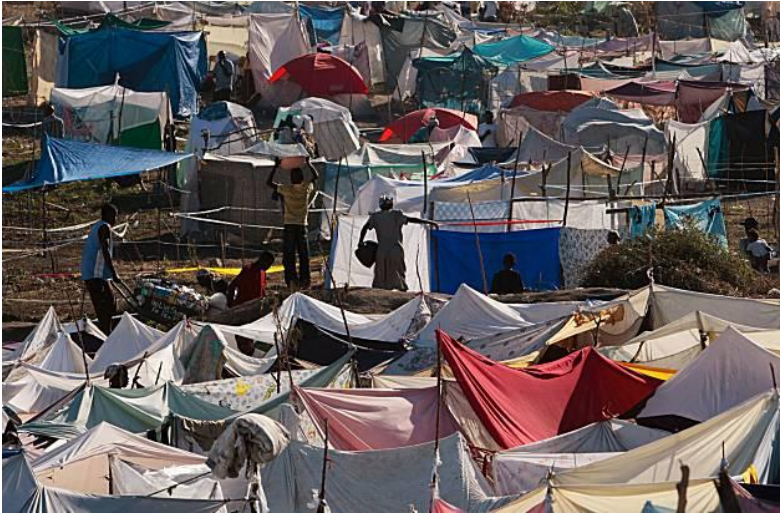
Haitians in survival mode in a ramshackle refugee camp close to the airport in Port-au-Prince, where basics of life are in not available in ample supply.