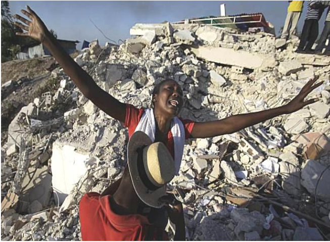
Woman sings praises to God after her sister was pulled alive from the rubble in Port-au-Prince.

We admit we do have questions and a limited understanding of why terrible things happen. But that does not mean there is nothing to say. The witness throughout all of Scripture urges us to seek God. Not some god who lives above tragedy -- controlling the fates of nature and humanity like the so-called gods of ancient Greek Olympus -- but, rather, the living God who lives in the centre of tragedy , suffering with us and for us. And is this witness not seen most clearly in the cross of Jesus, where God was joined to the fullest human experience of loss – suffering an unjust and cruel death out of love for all humanity? My friends, God does not cause chaos but enters into it with us. God does not send calamity but suffers with us through it. God does not stand over us but holds tightly onto us and promises never to let us go. As someone has written: “Wherever there is human tragedy and pain, the incarnate and crucified God is there.”